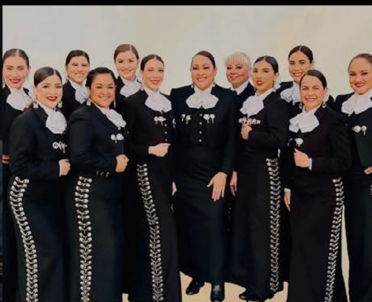
Mariachi Reyna de Los Angeles

Order today at LeshArtsCenter.org/Headliners