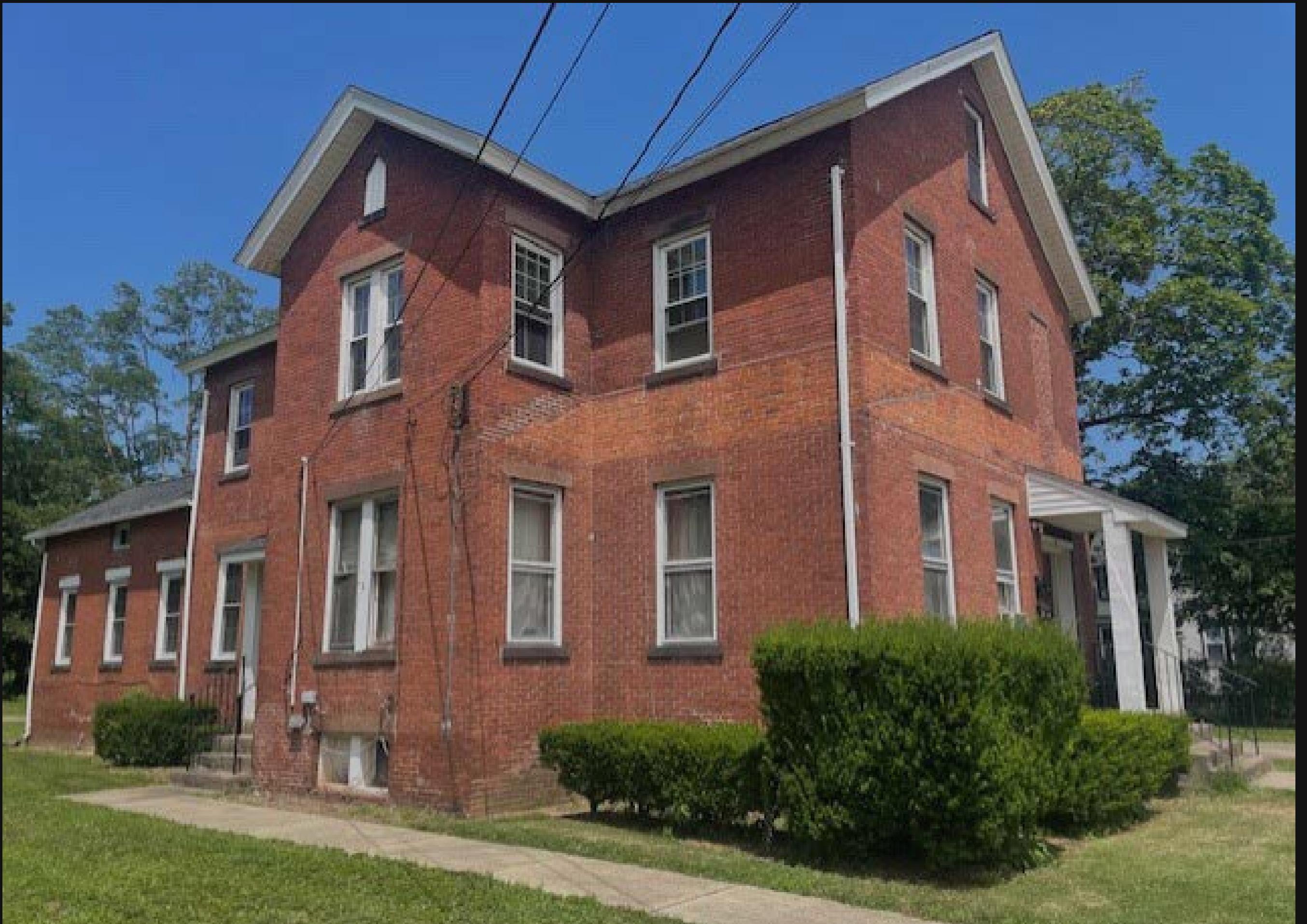
Archer Home for the Elderly and Infirm, Windsor, Connecticut.