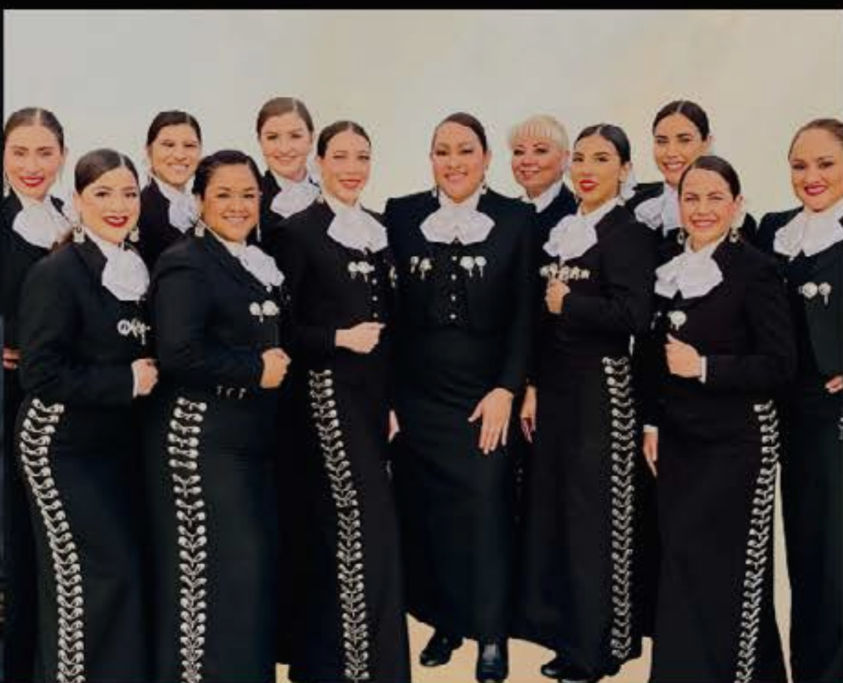
Mariachi Reyna de Los Angeles

Order today at LesherArtsCenter.org/Headliners