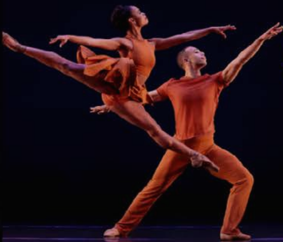
Dance Theater of Harlem