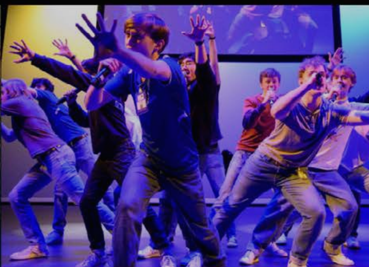
College Notes A Cappella